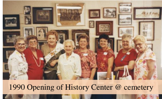
1990 Opening of History Center @ cemetery