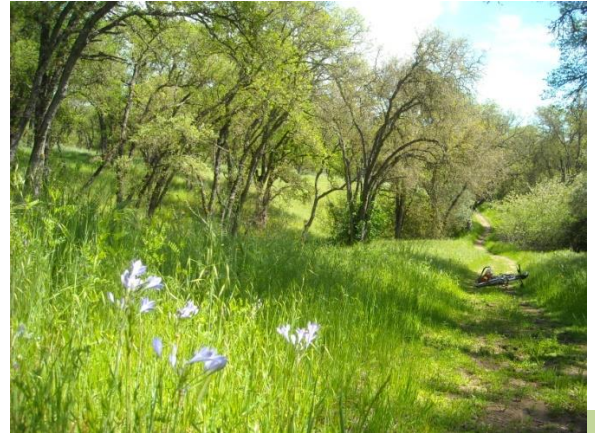
Triteleia laxa Ithuriel's, Spear blooms in Blue Oak Woodland/Savannah at Eastern Sailor Bar Park

On these balmy spring days, one can still find, among the rolling blue oak studded hills of eastern Sailor Bar, cool shaded canyon slopes graced with ferns, Interior Live Oaks and Western Red Buds. High and dry hilltops are adorned with Blue Dicks, Ithuriel's Spears, Soap Roots, Blue Oaks and countless other woodland species that truly make Fair Oaks a "diverse botanical garden".